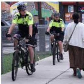
Detering crime on 2 wheels